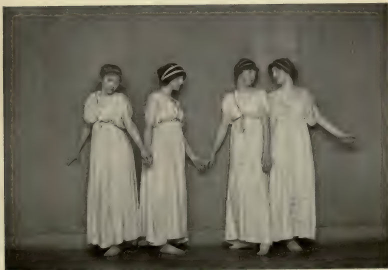
MASS AND LINE GROUP